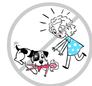
...EVEN if it's yours! Ask a grown up for help.