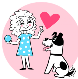
Train and play with dogs using treats and toys.