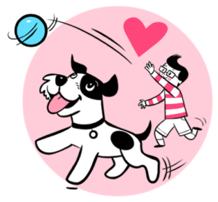
Be kind. Do things dogs like.